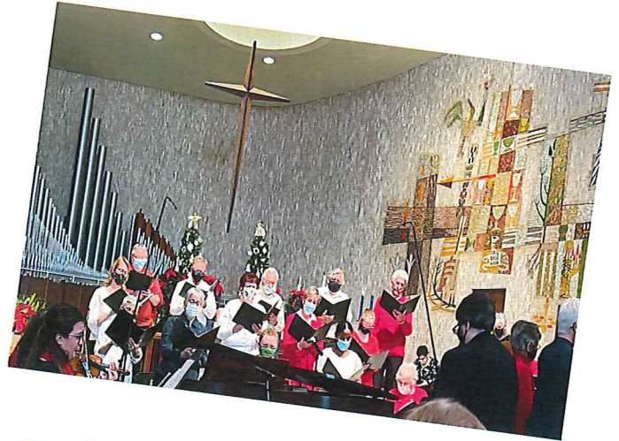
Lessons & Carols Service